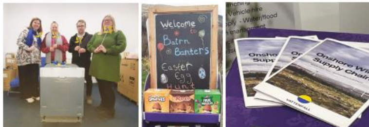
From left: New dishwasher for YMCA in East Ayrshire, Carsphairn's Bairns Banter Easter Egg hunt, Supply chain event.