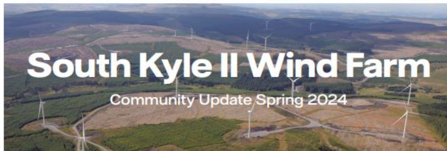
South Kyle Wind Farm