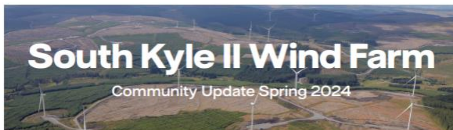
South Kyle Wind Farm