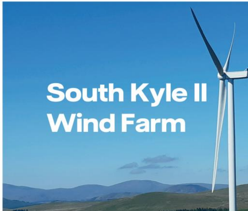
South Kyle Wind Farm