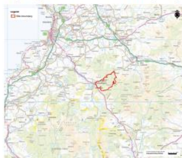
The red line boundary on the map above indicates the location of the site.

Larger maps available at www.vattenfall.co.uk/southkyle2