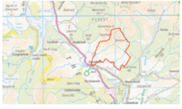
To view a larger map please go to: www.vattenfall.co.uk/quantanshillwindfarm