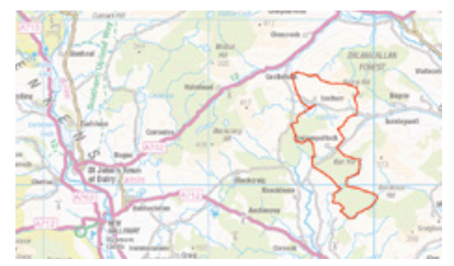
To view a larger map please go to: www.vattenfall.co.uk/whiteneukwindfarm