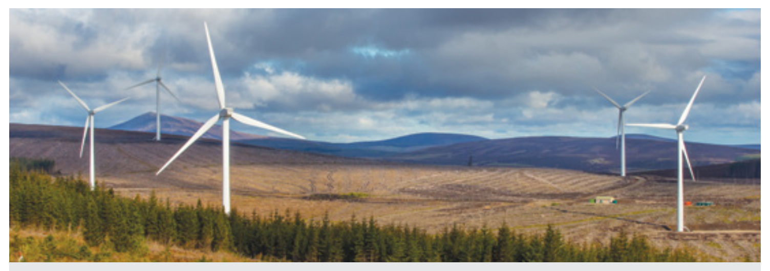
Clashindarroch Wind Farm