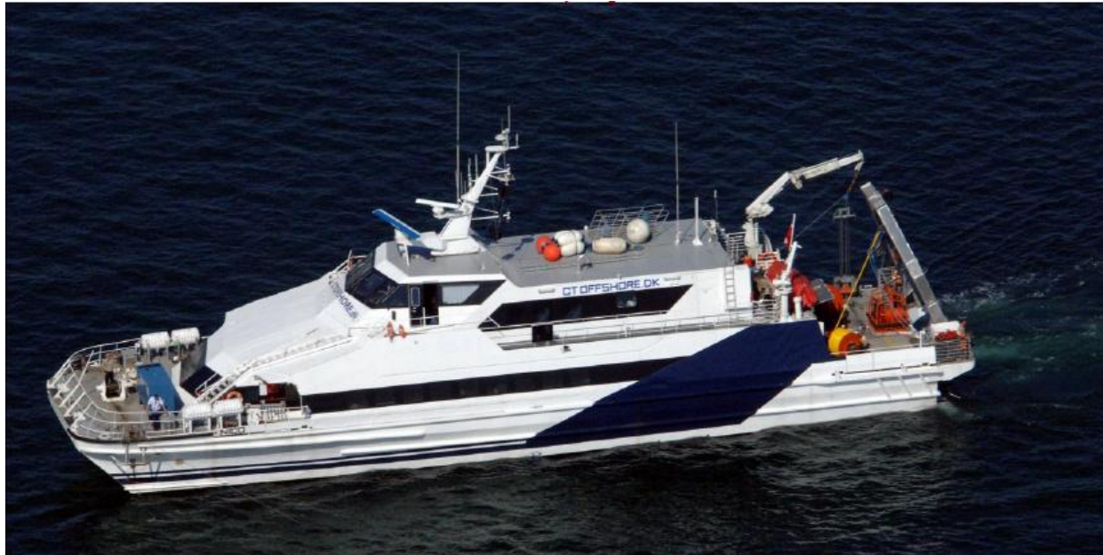
MS Nico 39.2m Length 10.0m Beam Callsign: OXTF2

Nature of operations: Cable Trenching Operations of 33kV Subsea Power Cables