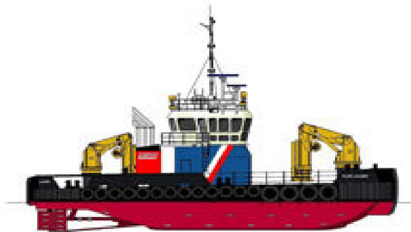
Forth Joustier. Length 26m. Beam 11.5m. Draft 2.35m Type: Multicat. Displacement 515 tonnes.